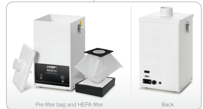
Pre filter bag and HEPA filter