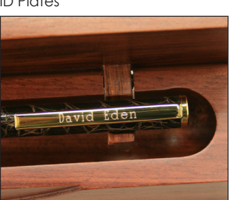
Pens & Gifts