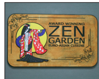
Print to Cut