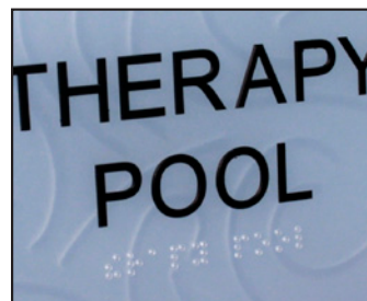
ADA Compliant Signage